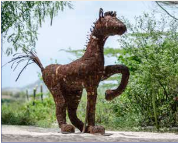
Equus - braid of iron