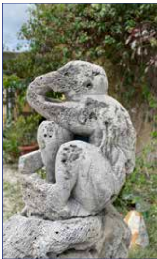
Thinker - Pensadó