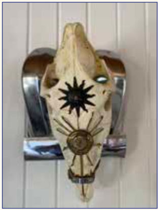
Donkey's head - Kabes di buriko