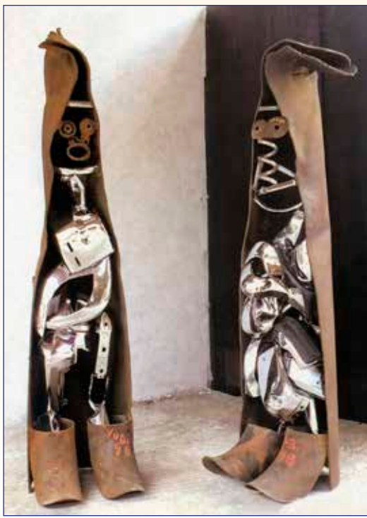
Sun eclipse and Moon eclipse