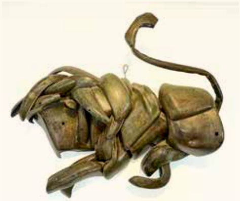
Lion - bumper art